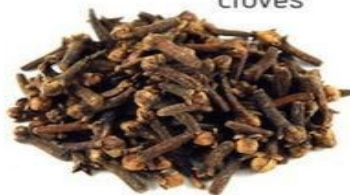
2 tbsp whole cloves